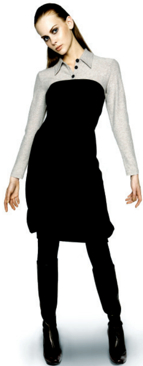
Nu-punk outfit: The Swiss Label, POR

Inside brings you the best trends for 2008, with influences ranging from burlesque to the jungle. One thing is for sure, mixing prints, colours and materials is the way forward.