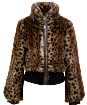
Ethno chic jacket: Navyboot, POR