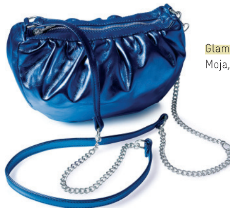
Glam metallic Ponpon bag: Moja, CHF 320