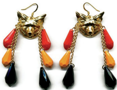
Ethno chic earrings: Toujours Toi, CHF 98