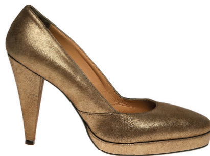
Glam gold shoes: A.F. Vandervorst at Monadico, CHF 659